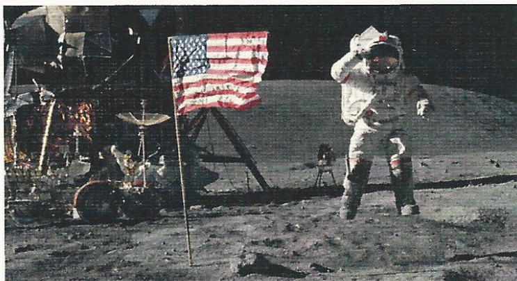
MAN WALKS ON THE MOON