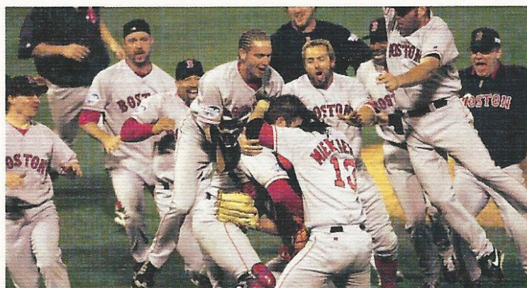
BOSTON RED SOX WIN THE WORLD SERIES