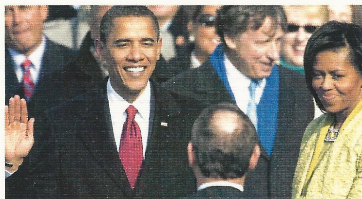
A BLACK GUY BECOMES PRESIDENT